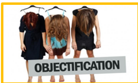
(Google free to use images)