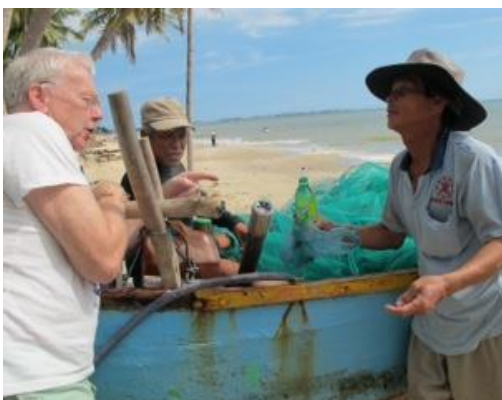
CEO talks with fishermen

Irish School of Ecumenics/Loyala Institute Building, Trinity College Dublin