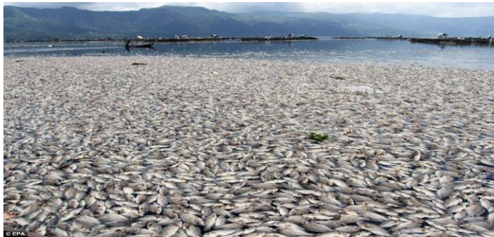
Steel Factory pollution kills fish